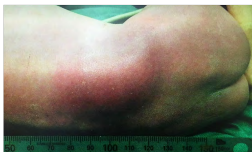
Figure 2: Infant subcutaneous hematoma.

The uterus is completely ruptured at the left fundus, with the tear measuring approximately 5 cm in diameter.