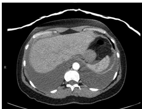
Figure 2: Angio-CT scan performed on the patient (bilateral pleural effusion and a small amount of perihepatic free fluid).

insertion was not needed. Blood analysis before discharge showed BHCG (Human Chorionic Gonadotropin) rising and normal levels of albumin, creatinine and ions. Ultrasound revealed an intrauterine gestational sac with an embryo of 2 mm without heartbeat. There was still no free abdominal fluid. She was discharged feeling well on the thirteenth day.