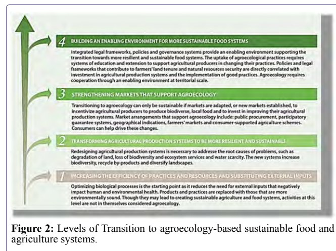
Figure 2: Levels of Transition to agroecology-based sustainable food and agriculture systems.

In addition, deriving from [2] five levels of food system change converting conventional agricultural production and food systems to agroecological food systems, the FAO defined four levels that serve as a roadmap in guiding this transition (Figure 2). Each level requires mechanisms in place to strengthen capacities, institutions, legal frameworks, policies and programmers that support transitional processes. The four levels describe a progressive path towards greater environmental, social and economic sustainability and can be implemented in any variation. The first two levels are at producer level. Levels 3 and 4 go beyond the producer level involving the broader food system and societal level. They require co-operation among producers within the same territory, which may require public support.