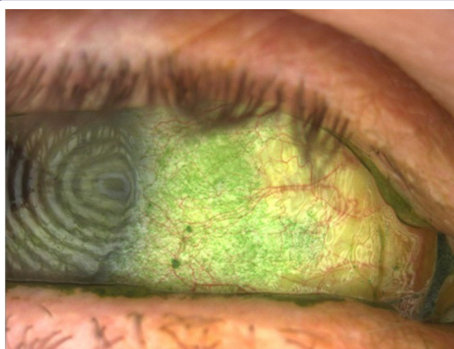
Figure 2: Representative ocular surface appearance of patients seen in this case series. Note the significant lissamine green punctate staining of the bulbar conjunctiva.

Diagnostic tests that employ the use of fluorescein, lissamine green and rose bengal dyes and are used in evaluating for aqueous deficiency in patients with and without SS. The most common tests include the use of fluorescein dye for the purpose of assessing the tear stability (TFBUT) and the staining of the ocular tissue. In general, the TFBUT is a measure of an evaporative dry eye rather than aqueous deficient dry eye and a measurement of less than 10 seconds is considered abnormal but not sensitive to patients with SS. Lissamine green is less commonly used in general practice but can provide further information towards SS diagnosis with any of the staining score analysis methods [28]. Rose bengal is another dye that stains the ocular tissue in a similar manner to lissamine green although it is known to cause slightly more discomfort on insertion than lissamine green [29]. The authors have observed lissamine green staining like that shown in figure 2 months before the serologic confirmation of SS or other autoimmune conditions.