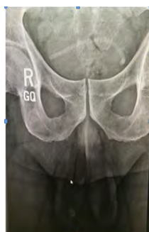
Figure 1: X-Ray of retained electrical wire tube.

A 69-year-old male inserted a plastic-coated electrical wire into his urethra for reported self-pleasure purposes. The patient removed the wire from his urethra, but the tubing remained. He did not experience any urinary symptoms. After not passing the electrical wire tubing for two days, he decided to present to the emergency department. X-ray revealed the plastic tubing within the bladder (Figure 1). The plastic tubing was removed under spinal anesthesia via cystoscopy and grasping forceps (Figure 2). This patient was discharged with a one-week course of oral antibiotics. Unfortunately, this patient was lost to follow up.