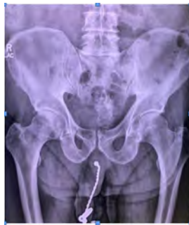
Figure 5: X-Ray of retained metal chain.