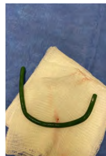
Figure 2: Retained electrical wire tube.

removed under spinal anesthesia with cystoscopy and Storz grasping forceps (Figure 4). Continuous bladder irrigation was done overnight. The patient was discharged forty-eight hours post-operative with an in-dwelling catheter and oral broad-spectrum antibiotics for two weeks. Post-catheter removal the patient's PVR was high due to a urethral stricture. Stricture dilatation was complete, but insufficient three months post-operative. This patient has been referred for reconstructive urethroplasty.