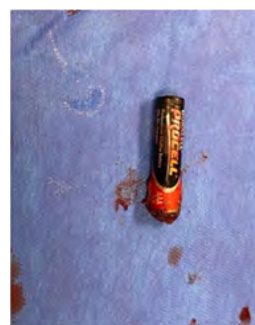
Figure 4: Retained AAA battery.