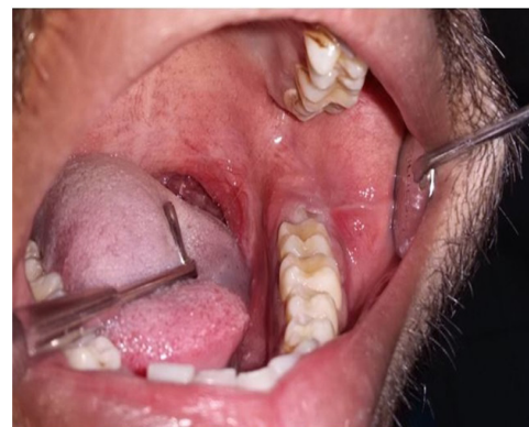
Figure 1: Impacted mandibular third molar showing inflamed pericoronal region.

Intra oral clinical examination reveals impacted lower left third molar with pericoronal tissue over the distal surface of the tooth (Figure 1). The retromolar tissue was inflamed and tender. The tooth was also tender to percussion. On inspection, occlusal surface had no evidence of dental caries.