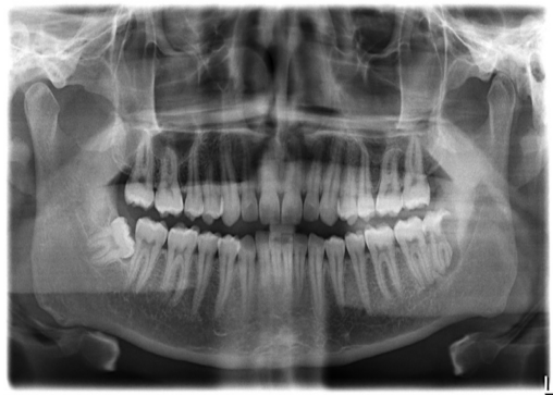
Figure 3: Panoramic radiograph showing the lesion.

Detailed history, clinical and radiographic presentation indicated a differential diagnosis that included entigerous cyst, or a periapical cyst or a keratocystic odontogenic tumor. The tooth was surgically removed under local anesthesia and the cavity was curetted. Tooth showed resorption similar to the radiographic appearance (Figure 4). It was interesting to note that the cystic lining was incomplete (Figure 5). The lining was attached to the root of the impacted molar. The histopathological features revealed stratified squamous epithelium that was having 4-5 layers of cell thickness. Fibrous connective tissue wall with spindle-shaped cells are also seen (Figure 6). All these findings pointed towards the diagnosis of radicular cyst. The extraction site exhibited uneventful healing pattern.