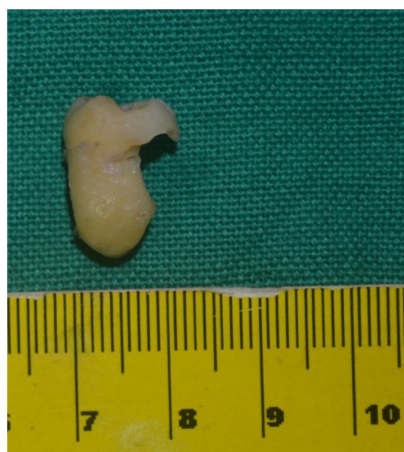
Figure 4: Surgically removed impacted molar showing resorption.

It is higher in third decade of the life [7]. Maxilla is most commonly affected, in which, maxillary anterior teeth are most prone to the cyst. In the mandible, premolars are commonly affected [1,8]. Incidence of cysts occurring in the impacted third molars varies from 0.001% to 3.1%, and dentigerous cysts are the most prevalent types of diagnosed cysts [9]. Incidence of periapical cyst among the periapical pathologies varies from 6% [10] to 55% [11]. Cyst formation is initiated by hydropic degeneration of epithelial cell rests of Malassez as a result of stimulation from non-vital tooth in periapical region [12]. Later many authors have proposed theories behind the development and the progression of the inflammatory periapical cysts which includes osmotic pressure theory that states, the progressive growth of the inflammatory apical cyst is due to the permeability of exudates towards the cystic cavity generated from necrosis of central epithelial cells. This mechanism is applicable to the enlargement of many cysts [13]. Another more specific theory is the abscess theory, which states these lesions can be composed of several components. The differential dynamics of individual components are capable of producing the epithelial proliferation in the abscess area near the apex [14].