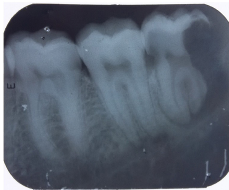
Figure 2: Intra oral periapical radiograph showing 'S' shaped lesion.

(Figure 2). The distal part of the tooth showed loss of radio opacity, suggestive of resorption. The distal wall of the pulp chamber and the pulp canal of the distal root also showed resorption. Mesial surface of the crown of the tooth showed radiolucency, suggestive of proximal caries. Panoramic radiograph was made to rule out whether it is an artifact. But the lesion was evident and bone around the lesion also showed resorption (Figure 3).