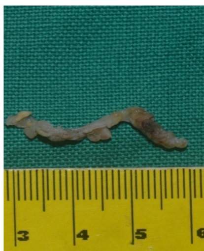
Figure 5: Incomplete lining of the cyst.