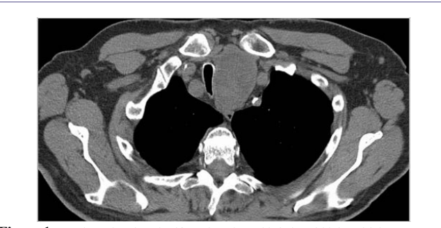
Figure 1: CT chest showing significantly enlarged left thyroid lobe with heterogenous appearance. There is resultant mild superior mediastinal extent as well as mass effect upon the trachea which is narrowed and displaced toward the right.

An 81-year-old male with a 45 pack-year smoking history was referred to our clinic for pulmonary nodules detected on workup for a 3-month history of unintentional weight loss. He did not complain of voice hoarseness, dysphagia, or dyspnea. There was no past history of malignancy or thyroid disease. Thoracic Computed Tomography (CT) revealed a 2 x 1.9 cm and 3.3 x 1.7 cm nodule with irregular margins in the superior and inferior lingular segments of the left lung, respectively, suspicious for malignancy. An enlarged and heterogeneous appearing 6 x 4 x 6.3 cm left thyroid lobe with mediastinal mass effect narrowing and rightward shift of the trachea was also noted (Figure 1). <sup>18</sup>F-Flurodeoxyglycose Positron Emission Tomography (FDG-PET) follow-up demonstrated intense avid-FDG uptake of all lesions. Flexible bronchoscopy was performed under general anesthesia with central EBUS-TBNA of the mediastinal nodes and thyroid mass followed by electromagnetic navigational sampling of the lingular nodules. The trachea was noted to be significantly deviated to the right with saber-sheath narrowing from extraluminal compression (Figures 2a,2b). Total procedure time was 76 minutes without complications.