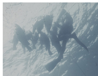
Figure 1: Spear fishing of grouper ( Epinephelus marginatus ) in the eighties, near Almería, South of Spain.

From these practices we have extracted the propositions below.