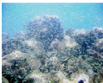
Figure 3: School of young fish above an artificial reef (7 m deep) of rock blocks in Martinique (WF1) [18].