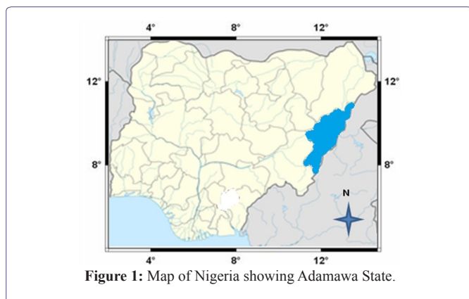
Figure 1: Map of Nigeria showing Adamawa State.