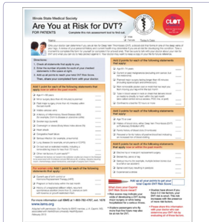
Figure 2: Standard Caprini's Risk Assessment.